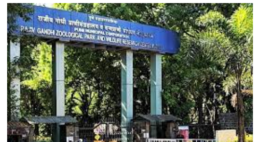
RAJIV GANDHI PARK