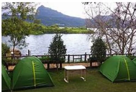
PAWNA LAKE CAMPING