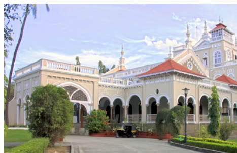
AGA KHAN PALACE