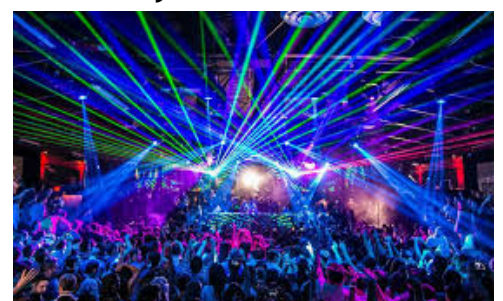
PUNE NIGHT LIFE