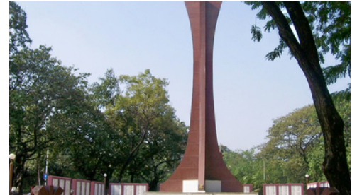
NATIONAL WAR MUSEUM